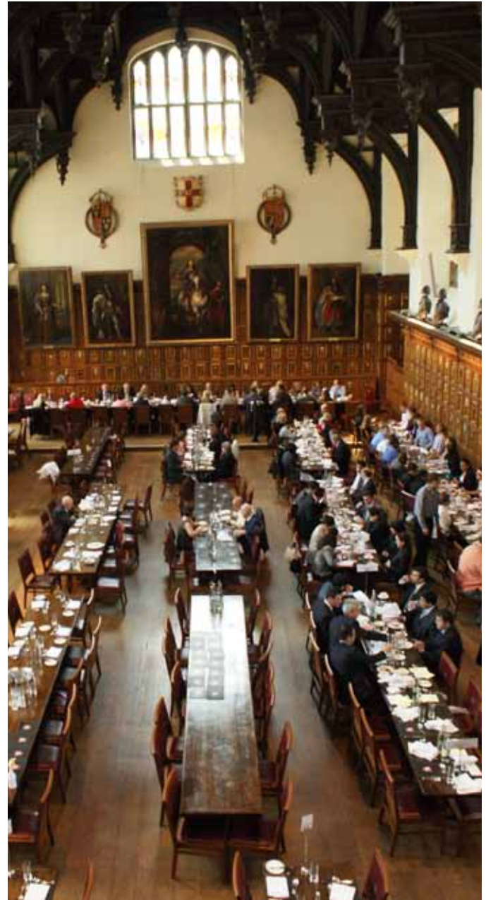
The Middle Temple's great hall. The Bencher's head table was a gift from Queen Elizabeth I and was cut from one tree

After the symposium, sixteen members of our group journeyed to Paris via the Chunnel and enjoyed Normandy Beach for Memorial Day, explored the history of the city and extended the memory of this year's out of country experience.