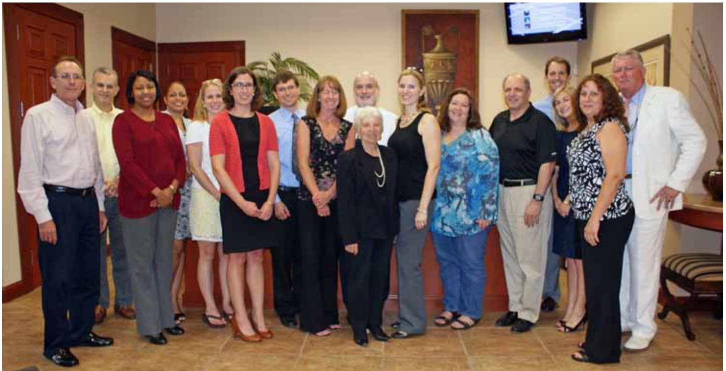
EJCBA Board Retreat - July 26, 2012